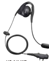
HS-94LWP Earhook headset with boom microphone and waterproof connector