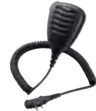
HM-168LWP IP67 waterproof speaker-microphone