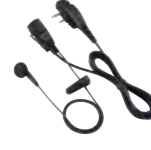
HM-166LA Light weight earphone microphone