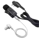
HM-153LA Lapel type microphone with earphone