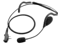
HS-95LWP Behind-the-head type with boom microphone and waterproof connector