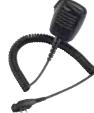
HM-159LA Full size durable speaker-microphone