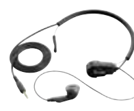
HS-97 + VS-4LA or OPC-2004LA* Throat microphone with earphone

* Either VS-4LA or OPC-2004LA is required when using HS-97 headset. VS-4LA: PTT switch cable for manual PTT operation OPC-2004LA: Plug adapter cable for VOX hands-free operation HS-94 and HS-95 also can be used with either VS-4LA or OPC-2004LA.