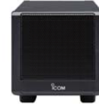
SP-38 High quality audio and matching height Maximum input: 7 W