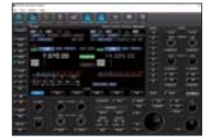
RS-BA1 (Version 2) IP remote control software