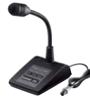
SM-50 Dynamic desktop microphone including [UP/DOWN] switches and a low cut function