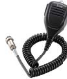
HM-219 Hand microphone with UP/DOWN switches (Same as supplied)