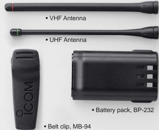
• VHF Antenna