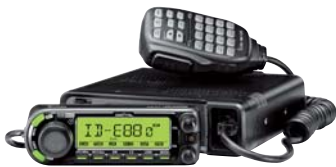
144/430MHz Dual Band Transceiver