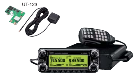
144/430MHz Dual Band Transceiver